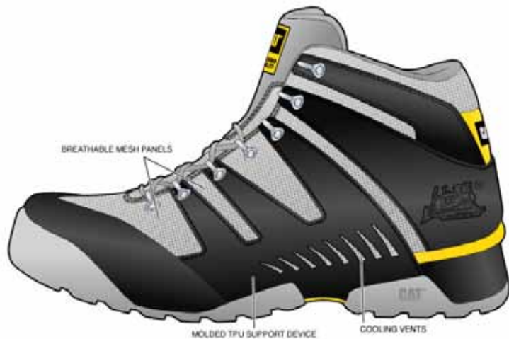
Design concept sketch for hiker styled workboot.