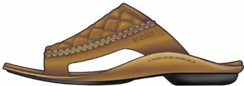
Cradle Slide concept drawing.