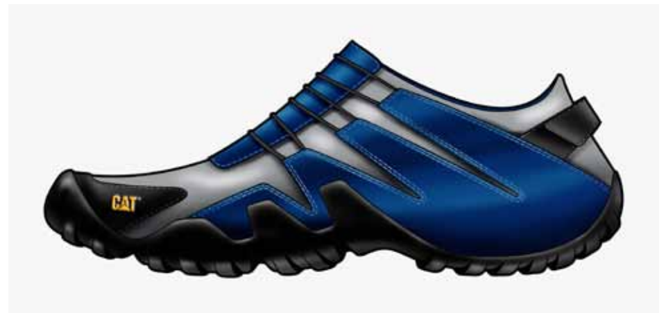
Sketch for water sports jogger/trekker.