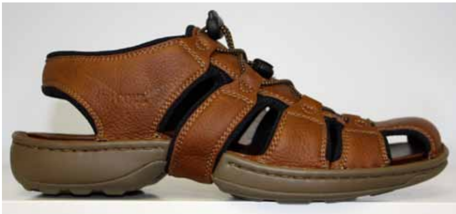
Prototype of opanka sandal.