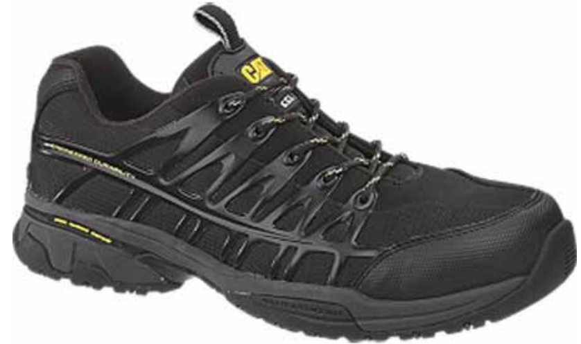
Catalog product photo of the Headway.