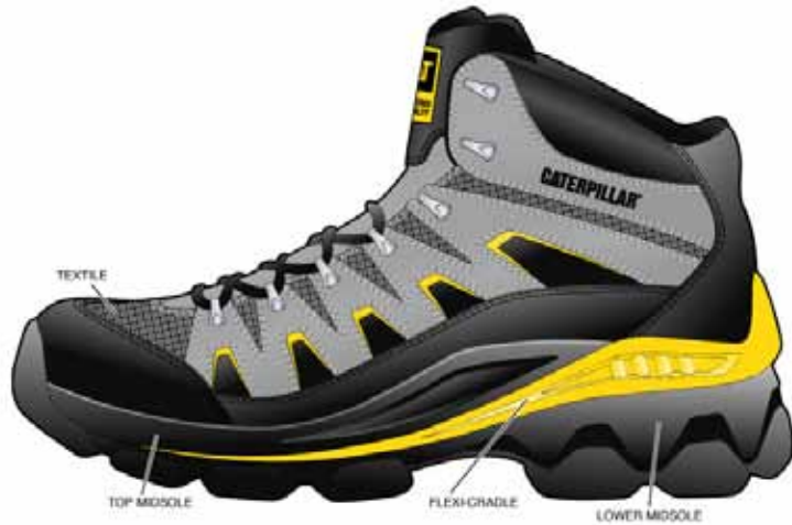
Design concept sketch for a new workboot construction that incorporates a molded cradle (FlexiCradle).

210-900-3156 www.shoedesign.andykalns.com