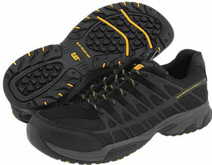
Product photo of the Headway showing the slip-resistant tread pattern on the outsole.