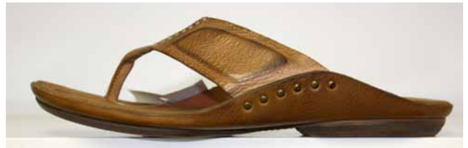
Cradle Sandal prototype.