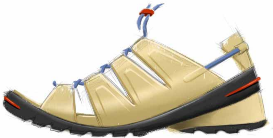
Sketch for water sports sandal/trekker.