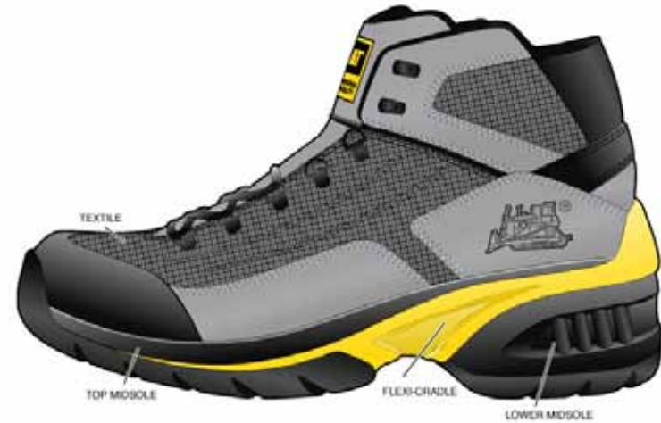
Design concept sketch for a new workboot construction that incorporates a molded cradle (FlexiCradle).