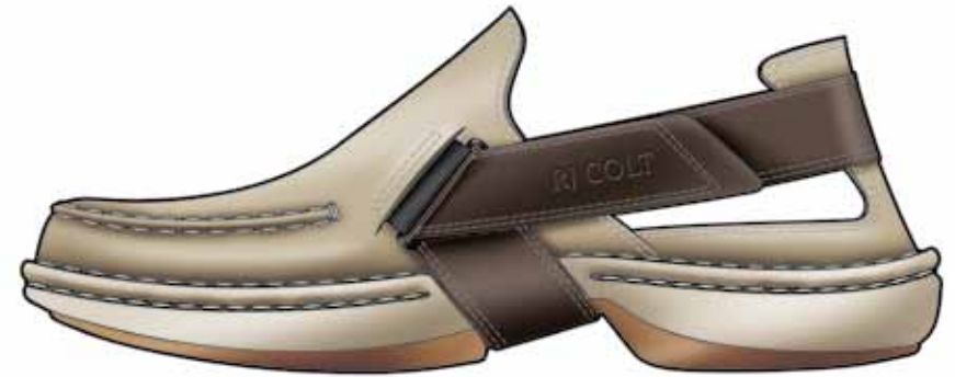
Design rendering of an opanka slip-on with fit adjustment strap.