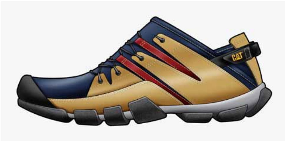
Sketch for water sports jogger/trekker.

210-900-3156 www.shoedesign.andykalns.com