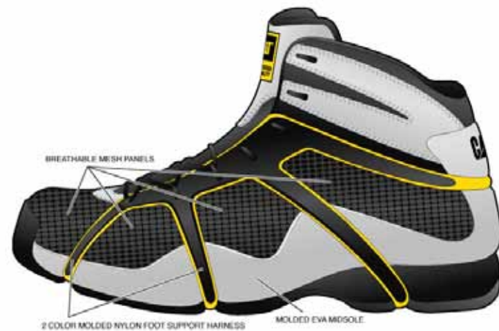
Design concept sketch for athletic-hiker styled workboot.