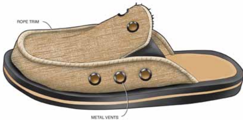
Distressed canvas upper sandal/clog with EVA outsole.