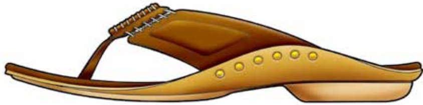
Cradle Sandal concept drawing.

210-900-3156 www.shoedesign.andykalns.com