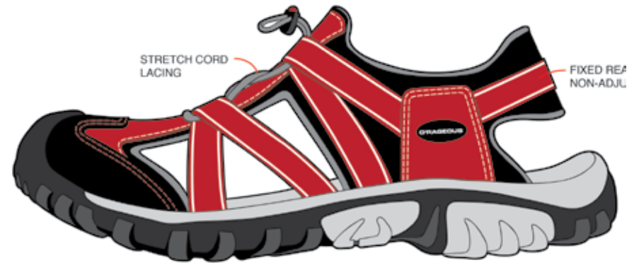
Closed toe sandal designed for rugged terrain.