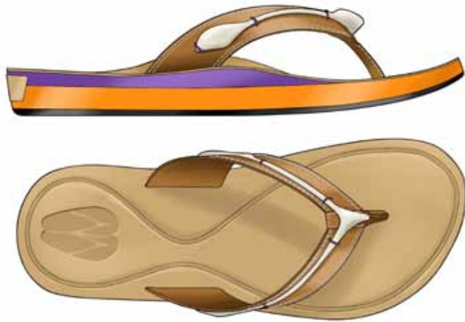
Leather upper flip-flop design with attached embellishment.

210-900-3156 www.shoedesign.andykalns.com