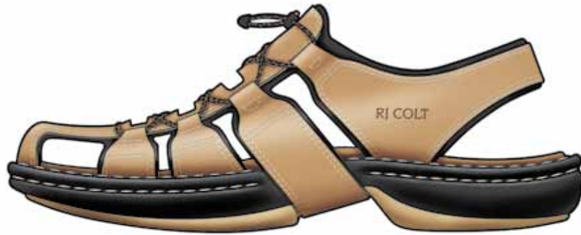
Design rendering of an opanka sandal with wrap around adjustment fit adjustment strap and stretch cord lacing.

210-900-3156 www.shoedesign.andykalns.com