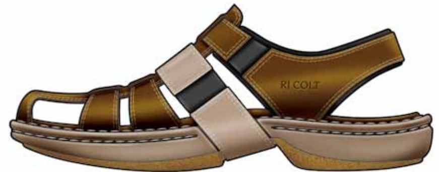
Design rendering of an opanka sandal with wrap around adjustment fit adjustment strap.