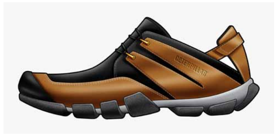
Sketch for water sports jogger/trekker.