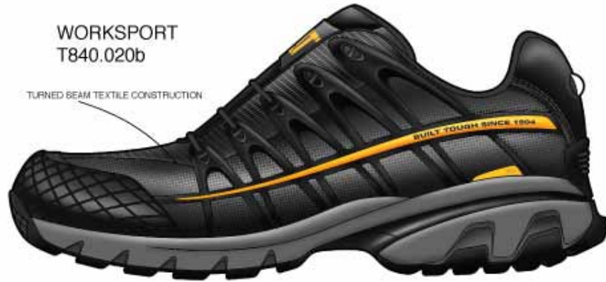
Final design sketch for a new athletic styled S/T workboot.

210-900-3156 www.shoedesign.andykalns.com