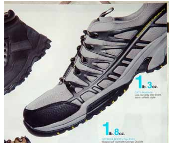
Footwear News article about lightweight workboots. At 1lb. 3oz. the Headway is one of the lightest.