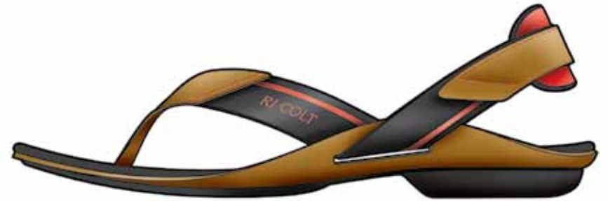
Cradle Sandal concept drawing.